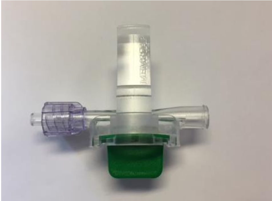
Assembled Product, 844-28 Dome sterile. Part no.: 30144